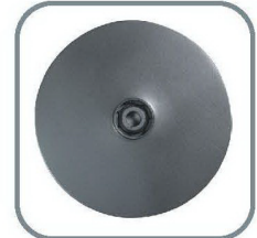
Stainless Steel Impeller